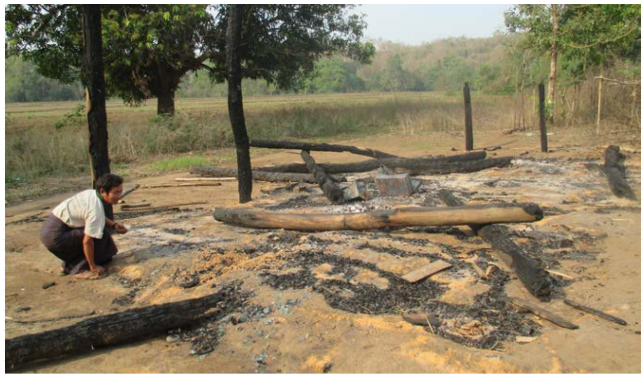
Man standing in front of the burnt down remains of his house in Tha Nay Moo village, following clashes between the Myanmar Army and the Democratic Karen Buddhist Army (DKBA).

Karen Human Rights Group (KHRG), Karen Environmental and Social Action Network (KESAN), Thwee Community Development Network (TCDN).