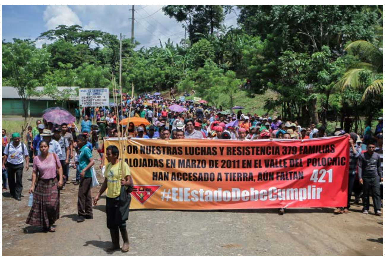
Momentum builds in the fight against evictions in Guatemala: Making us all a bit braver Polochic Case

Oxfam, Action Aid, Comité de Unidad Campesina CUC.